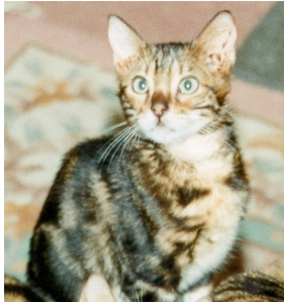
Sarez Natala (SBT Female) - Circa August 1996

However, surprisingly, we were invited to show again, although Mr. Al Fayed never came to see us. Later, several newspapers heard about what had happened and tried to buy the story. But we have integrity and would never want publicity that humiliates another, so we refused. And we kept Natala.