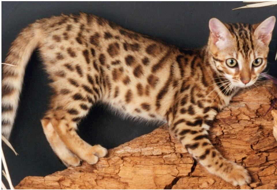
Sarez Secret Recipie (F2 Female) - Circa March 1997

My main passion in life has always been for true wild cats - my fantasy animals. Nature has bestowed so much upon these exotic creatures; astonishing beauty, independent characters and souls that are full of fire... but for most, they are unattainable - an impossible dream.