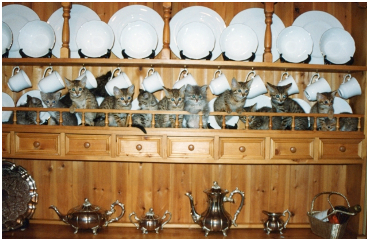
SBT Sarez Bengal Kittens - Circa August 1994