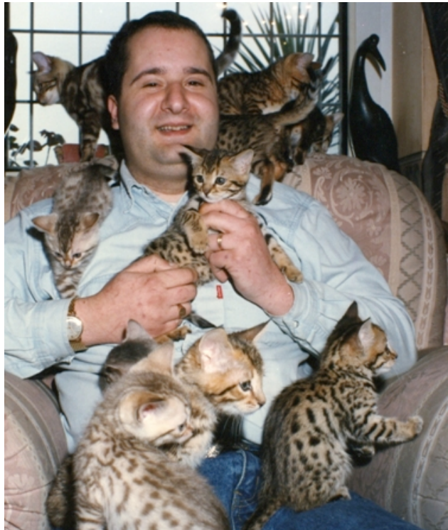
Esmond Gay & Sarex Bengal Kittens - 30 th April 1996

I'm a very driven person and so within two years Sarah and I owned a huge collection comprising of some of the best Bengals in existence; we had all the colours and all the generations including three of just four rare Filial 1 (F1) Bengal x leopard cat hybrids in Britain, and we had some superb late generation (SBT) studs and females, funding their purchase by selling their babies. My once idle obsession had turned us into one of the world's largest and most significant breeders of these cats!