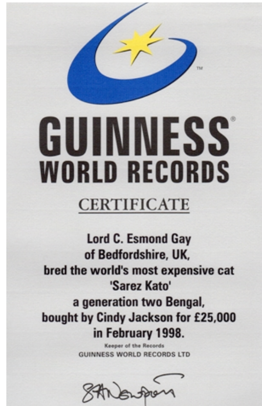
World Record - Kato (F2) - February 1998

everything about the breed and so I spent several hours explaining, and by the end they had fallen in love with a brown spotted F2 male named Sarez Atsu . But as he was too young to go, they booked a date to come to our home and pick up their baby.